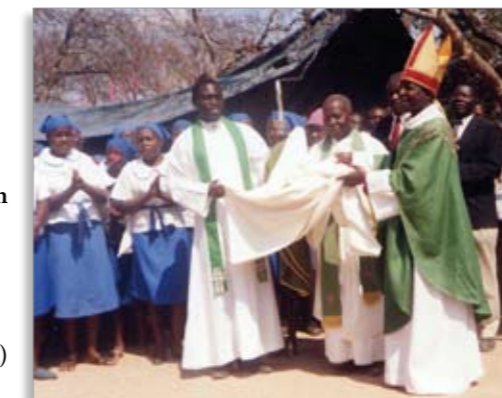
The Bishop of Masvingo blesses a CBS vestment at Chivhu in Zimbabwe