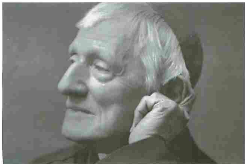
Blessed John Henry Newman

Jesus Christ is one of Resurrection from death, we just need the courage to follow the Hope his call holds for us. So we have some choices: stay and fight and hope against the odds that the society works; join the Ordinariate and risk an un-clear way forward; withdraw and make our parishes a sign of something distinctive in the Church, shoring them up like a lighthouse in an unwelcoming sea. Whatever road we choose will be challenging, but it's the Lord who calls us to discipleship and faithfulness, and only with the Lord can we take that road he calls us to follow. It's his love that bade us welcome; let not our souls draw back!