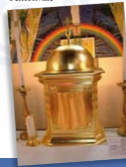
The restored Tabernacle at S Silas Pentonville

I give you thanks, Lord, holy Father, everlasting God. In your great mercy, you have fed me, a sinner and your unworthy servant, with the precious Body and Blood of your Son, our Lord Jesus Christ. I pray that this holy communion may not serve as my judgement and condemnation, but as my forgiveness and salvation. May it be my armour of faith and shield of good purpose. May it root out in me all vice and evil desires, increase my love and patience, humility and obedience, and every virtue. Make it a firm defence against the wiles of all my enemies, seen and unseen, while restraining all evil impulses of flesh and spirit. May it help me to cleave to you, the one true God, and bring me a blessed death when you call. I beseech you to bring me, a sinner, to that great feast where, with your Son and the Holy Spirit, you are the true light of your holy ones, their flawless blessedness, everlasting joy, and perfect happiness. Through Christ our Lord. Amen.