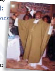
CBS vestments arrive at S Mark's Kibi, Ghana