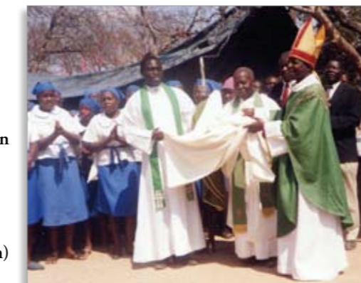
The Bishop of Masvingo blesses a CBS vestment at Chivhu in Zimbabwe