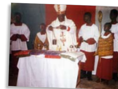
The Bishop of Koforidua (Ghana) blesses a CBS grant to S Andrew's, Anum

ROOT (Religious of Orthodox Tradition) Grant for a promotional video