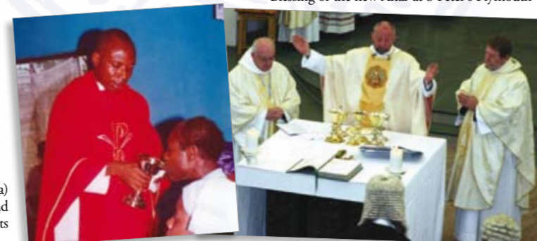
Blessing of the new Altar at S Peter's Plymouth