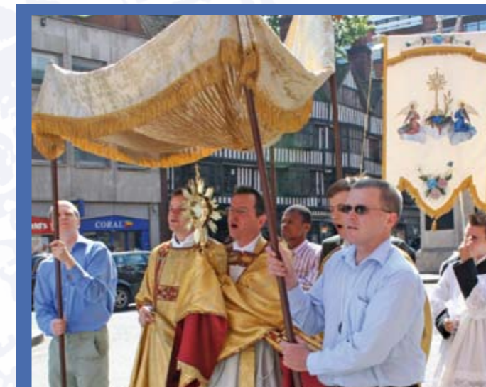
The CBS Festival - Procession of the Blessed Sacrament through the streets of London.